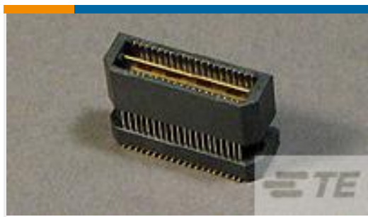
TE Part # 5-1658439-1 MSB0.80PL14ASY28DP,GP,30,VCTR