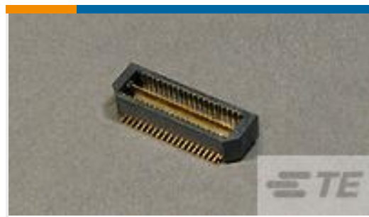
TE Part # 5-1658463-1 MSB0.80PL5ASY28DP,GP,30,VCTR