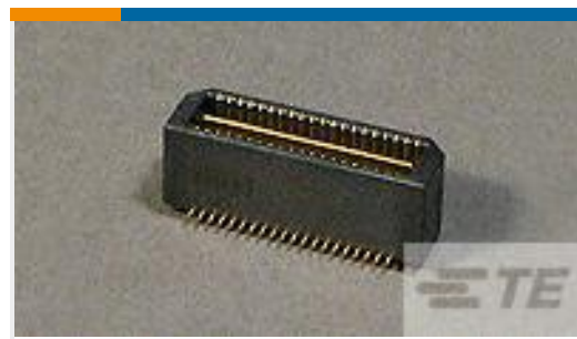
TE Part # 5-1658464-1 MSB0.80PL8ASY28DP,GP,30,VCTR