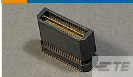
TE Part # 5-1658466-1 MSB0.80PL16ASY28DP,GP,30,VCTR