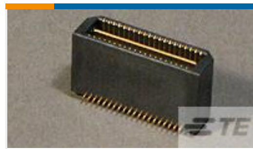
TE Part # 5-1658465-1 MSB0.80PL11ASY28DP,GP,30,VCTR